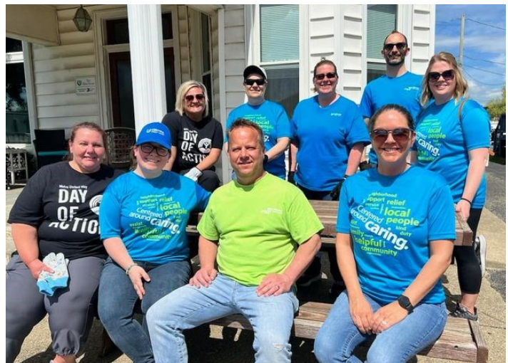
Thanks to our friends from Centra Credit Union for volunteering their time to do spring cleaning on the CLM property! They weeded, planted flowers and put down mulch as part of Metro United Way's Mayor's Give A Day Program in April.