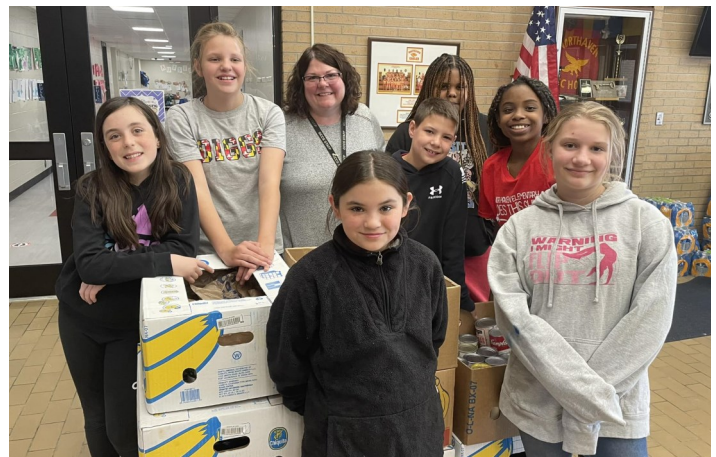
Thank you to the Northaven Elementary School Student Council for holding a food drive for the CLM Food Pantry. They collected nearly 1,500 pounds of food. That's awesome!