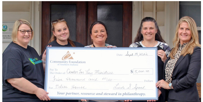
The Community Foundation of Southern Indiana donated a $5,000 grant to the CLM Bliss House. We appreciate your continued support of our Bliss House program. Thank you!